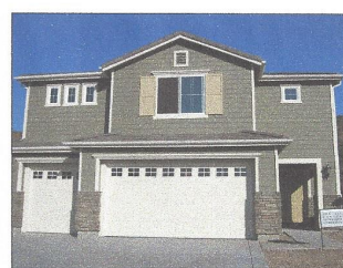
July 2005 Our rebuilt home is complete!

The information presented in this publication is for general informational purposes and is not a substitute for legal advice. If you have a specific legal issue or problem, United Policyholders recommends that you consult with an attorney. Guidance on hiring professional help can be found in the "Find Help" section of www.uphelp.org . United Policyholders does not sell insurance or certify, endorse or warrant any of the insurance products, vendors, or professionals identified on our website.