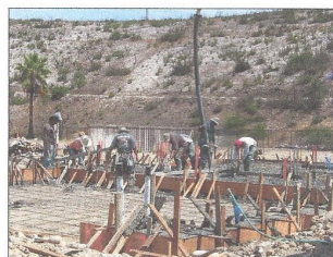
August 2004 Foundation being poured on our new home.