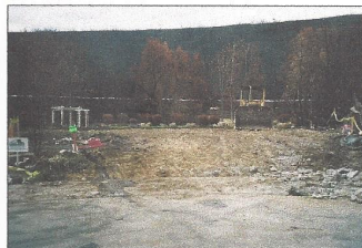
Early December, 2003 Debris removal from our lot.