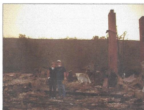
October 28, 2003 We're finally allowed back into our neighborhood to survey the damage.