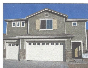
July 2005 Our rebuilt home is complete!

The information presented in this publication is for general informational purposes and is not a substitute for legal advice. If you have a specific legal issue or problem, United Policyholders recommends that you consult with an attorney. Guidance on hiring professional help can be found in the "Find Help" section of www.uphelp.org . United Policyholders does not sell insurance or certify, endorse or warrant any of the insurance products, vendors, or professionals identified on our website.