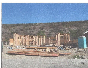
September 2004 Sticks in the air! Framing begins.