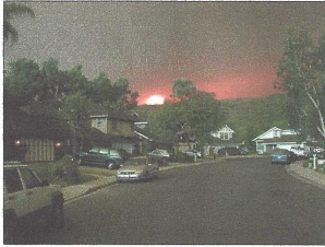
October 26, 2003 Last picture of our house standing...as the Cedar Fire crests the hill behind our home.