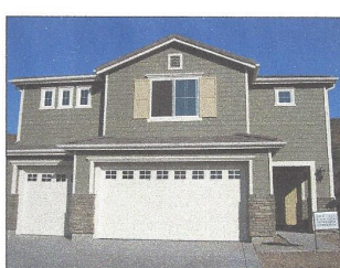
July 2005 Our rebuilt home is complete!

The information presented in this publication is for general informational purposes and is not a substitute for legal advice. If you have a specific legal issue or problem, United Policyholders recommends that you consult with an attorney. Guidance on hiring professional help can be found in the "Find Help" section of www.uphelp.org . United Policyholders does not sell insurance or certify, endorse or warrant any of the insurance products, vendors, or professionals identified on our website.