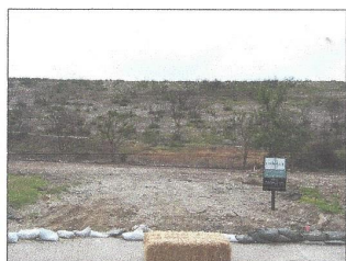
April 2004 We've hired a builder to reconstruct our home.