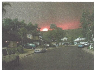
October 26, 2003 Last picture of our house standing...as the Cedar Fire crests the hill behind our home.