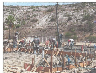
August 2004 Foundation being poured on our new home.