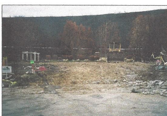
Early December, 2003 Debris removal from our lot.