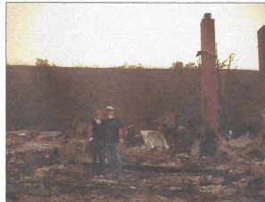
October 28, 2003 We're finally allowed back into our neighborhood to survey the damage.