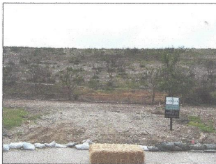
April 2004 We've hired a builder to reconstruct our home.