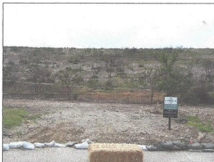
April 2004 We've hired a builder to reconstruct our home.