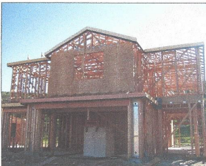
December 2004 It's starting to look like a house.