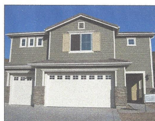
July 2005 Our rebuilt home is complete!

The information presented in this publication is for general informational purposes and is not a substitute for legal advice. If you have a specific legal issue or problem, United Policyholders recommends that you consult with an attorney. Guidance on hiring professional help can be found in the "Find Help" section of www.uphelp.org . United Policyholders does not sell insurance or certify, endorse or warrant any of the insurance products, vendors, or professionals identified on our website.