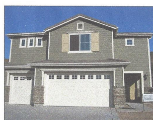
July 2005 Our rebuilt home is complete!

The information presented in this publication is for general informational purposes and is not a substitute for legal advice. If you have a specific legal issue or problem, United Policyholders recommends that you consult with an attorney. Guidance on hiring professional help can be found in the "Find Help" section of www.uphelp.org . United Policyholders does not sell insurance or certify, endorse or warrant any of the insurance products, vendors, or professionals identified on our website.