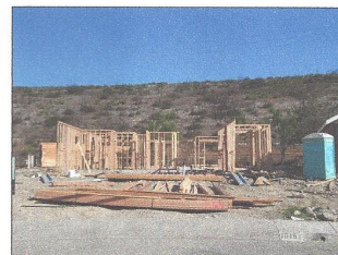
September 2004 Sticks in the air! Framing begins.