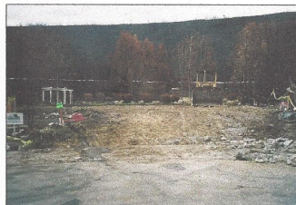
Early December, 2003 Debris removal from our lot.