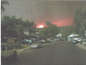
October 26, 2003 Last picture of our house standing...as the Cedar Fire crests the hill behind our home.