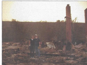
October 28, 2003 We're finally allowed back into our neighborhood to survey the damage.