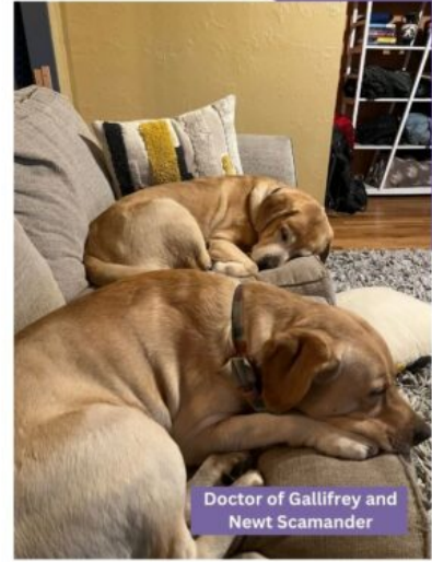
Doctor of Gallifrey and Newt Scamander