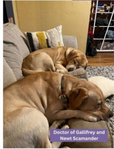
Doctor of Gallifrey and Newt Scamander