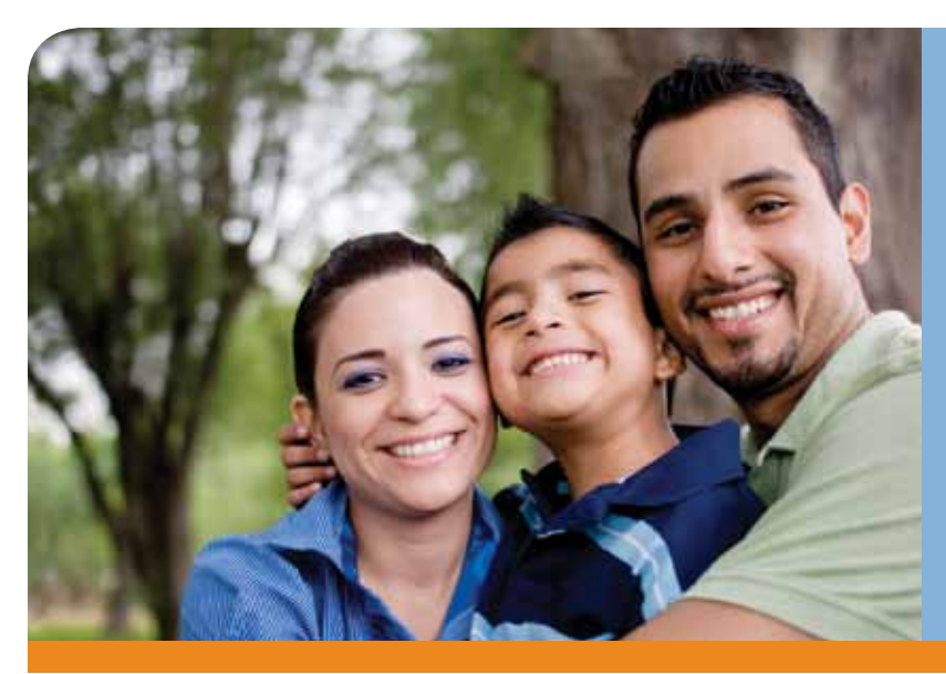
Risk Adjustment, Reinsurance, and Risk Corridors

Individuals with health conditions and disabilities often face challenges in obtaining health insurance coverage.<sup>203</sup> This is, in part, because insurers that enroll less-healthy individuals, such as those with chronic conditions, face much greater risk than those that enroll relatively healthy individuals. To avoid this increased risk, insurers may "cherry pick" the healthy while avoiding the sick.