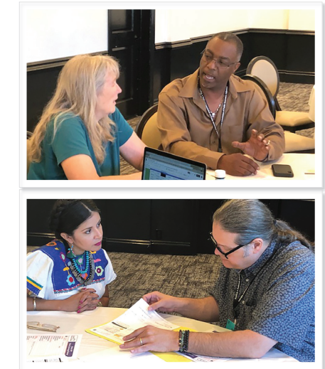
Our expert volunteers reviewed policies and made helpful suggestions to improve disaster-readiness.

Please support United Policyholders, like our Facebook page, and share our website with friends, family and co-worker: UPHELP.ORG .