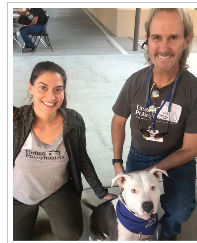
UP staff and volunteers Team UP to provide expertise, empathy, and comfort after disasters.

Thanks to grant funding, we are recording our workshops so they can be viewed online 24/7.