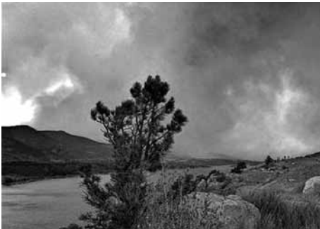
UP has a Colorado Roadmap to Recovery workshop scheduled in August

Our Roadmap to Recovery services will be in high demand again in Colorado when this summer's horrendous wildfires are contained. Just as we did in Boulder in 2010, we'll be deploying staff and volunteers and partnering with local government and non-profit groups to educate and support those who've lost homes. We know from past experience that many will be severely underinsured and need our help to resolve claim disputes and minimize payment delays. Our staffing resources will be stretched thin in the coming months as we simultaneously run our R2R program and continue the political