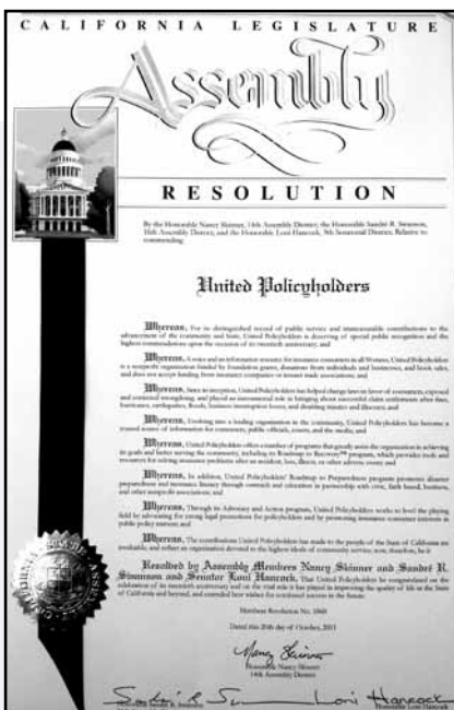
UP was honored by the California Legislature and the City of Oakland for our 20 years helping consumers.