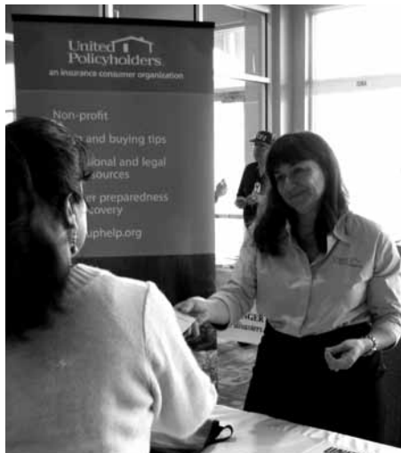
Distributing our Disaster Recovery Handbook at a One Stop Help Center

To view the complete survey results, visit www.uphelp.org/surveyresults