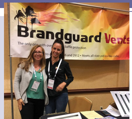
(Right) Installing vent screens is an inexpensive way of reducing wildfire risk.

UP knows what matters when it comes to insurance. Thanks to two government grants from LISTOS CALIFORNIA and DENVER UASI (Urban Area Security Initiative), we have been helping vulnerable homeowners and renters in San Francisco and in Central Colorado protect their assets and be savvy insurance buyers...all from the comfort and socially distanced safety of Zoom. Learn more at: www.uphelp.org/checkup .