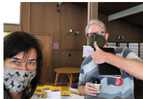
COVID hasn't slowed UP down...Boulder Creek Wildfire Recovery Resource Center.