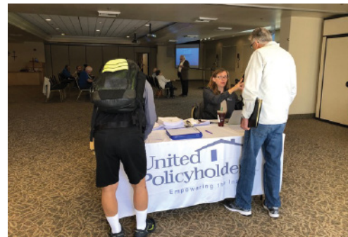
January 2020 free clinic where Woolsey fire survivors accessed financial decision making help via UP.