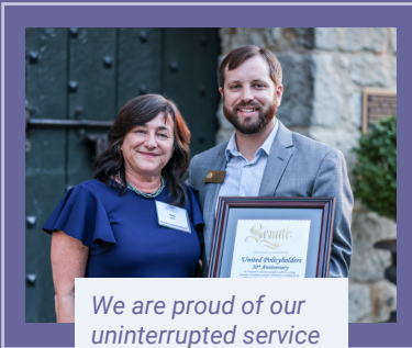
We are proud of our uninterrupted service delivery during COVID.

While the pandemic had a profound impact on so much of our world, natural disasters did not stop, and the need for our disaster recovery services remains greater than ever. Since March 2020, our Roadmap to Recovery® Program has supported households impacted by more than 35 natural disasters across the United States.