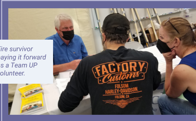
Fire survivor paying it forward as a Team UP volunteer.

Virtual Q&A Webinars where individuals submit their questions and get answers from UP staff, expert partners and trained volunteers.