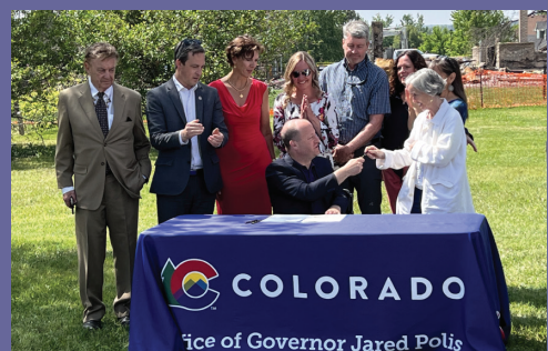
Two UP volunteers were at the signing ceremony for a new law we helped enact that requires insurance policies to keep pace with actual recovery timelines and costs.

Thanks to support from our charitable foundation partners, Find Help sponsors, event sponsors, and our individual and corporate donors, UP continued to provide hands-on and online problem-solving help to thousands of consumers and served as an effective advocate for fair insurance practices in all 50 states throughout 2022.